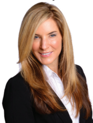
St. Theresa Parishioner