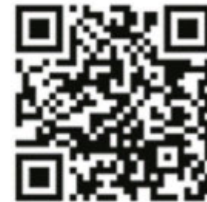
QR code Registration TMIY Conference

This conference is open to all men looking to energize their spiritual journey this summer.