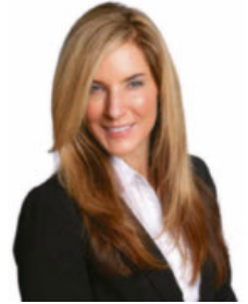
St. Theresa Parishioner