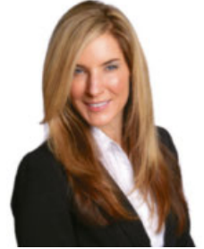
St. Theresa Parishioner