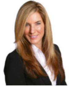
St. Theresa Parishioner