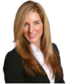
St. Theresa Parishioner