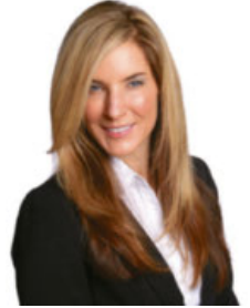
St. Theresa Parishioner