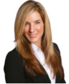
St. Theresa Parishioner