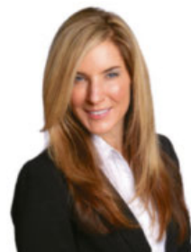
St. Theresa Parishioner