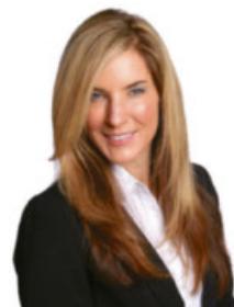
St. Theresa Parishioner