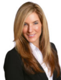
St. Theresa Parishioner