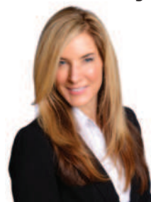
St. Theresa Parishioner