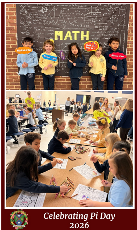
Celebrating Pi Day 2026