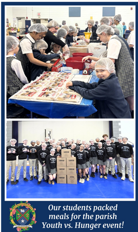
Our students packed meals for the parish Youth vs. Hunger event!