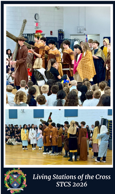
Living Stations of the Cross STCS 2026