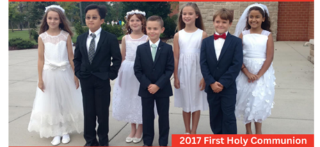
2017 First Holy Communion

Email your updates to alumni@stsashburn.com